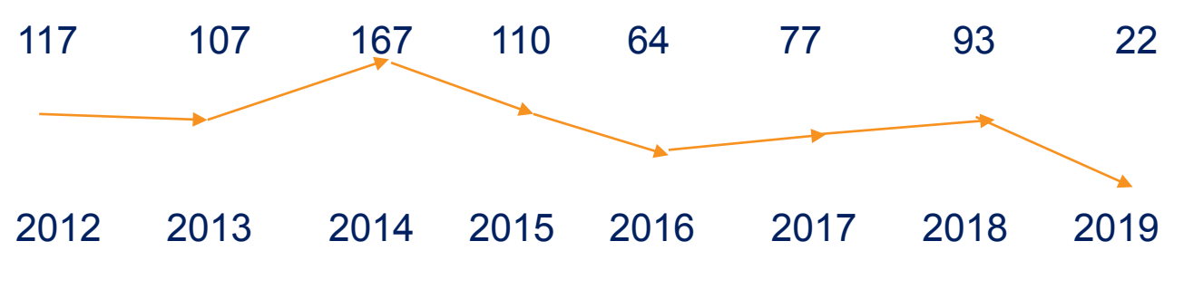
Meet and Confer Meetings