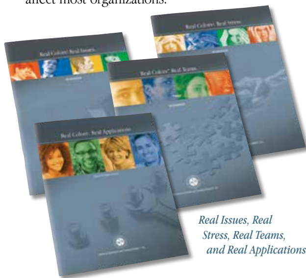
Real Issues, Real Stress, Real Teams, and Real Applications.

As a Real Colors facilitator, you will have the ability to purchase and deliver the Real Colors Personality Instrument, as well as our Advanced Training Modules that have been specifically designed to address the everyday issues that affect most organizations.